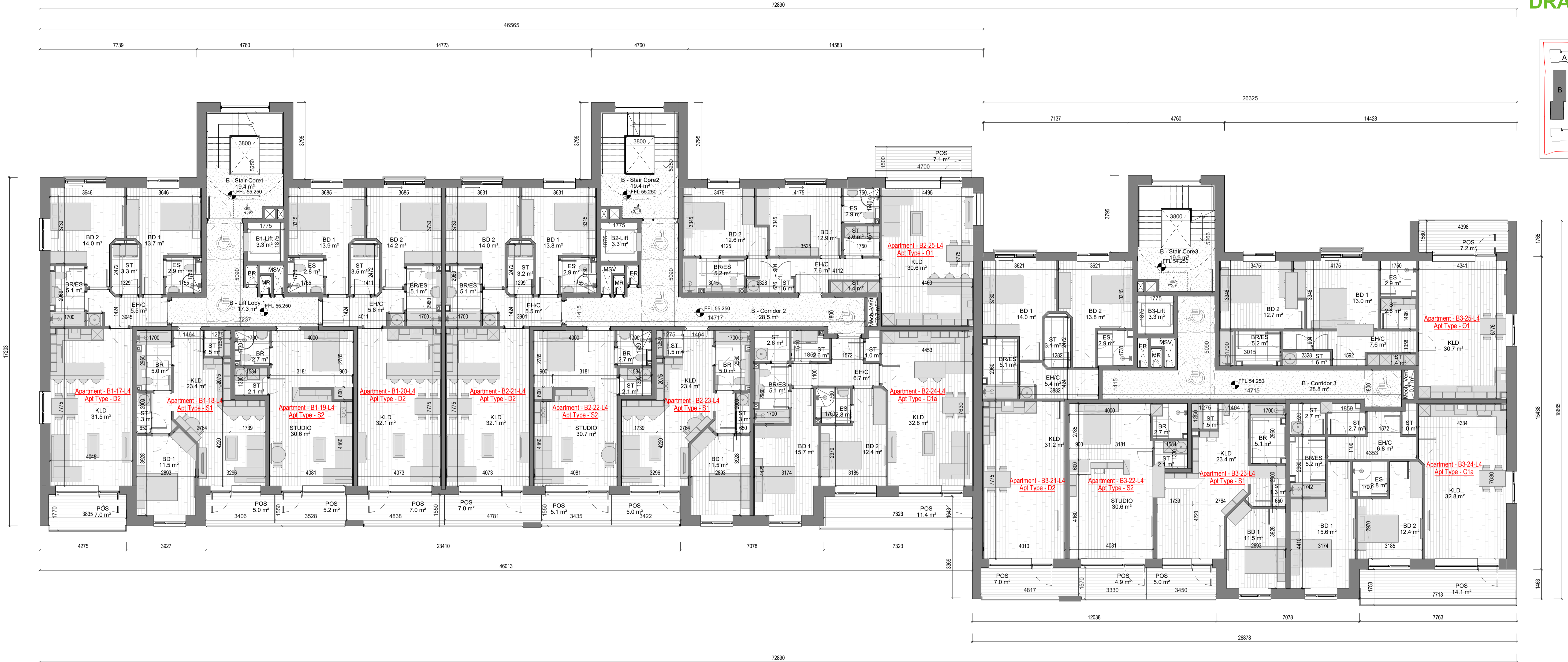
1 GA - Fourth Floor Plan 1 : 100